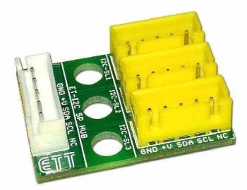
ET-I2C 5P HUB